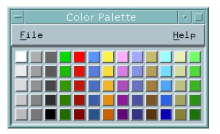
Figure 4: Color Palette showing the default colors.

The color selector brings up the Color Palette, shown in Fig. 4. MEDM has a colormap consisting of 65 colors. There is a default colormap, but each display may have its own colormap, defined in its display file or specified by the name of a separate colormap file.